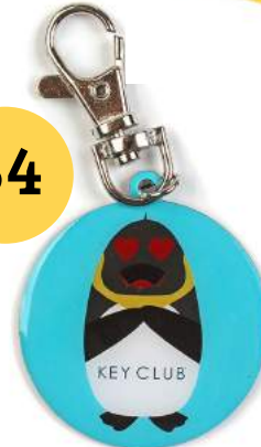
BAG CHARM (2)