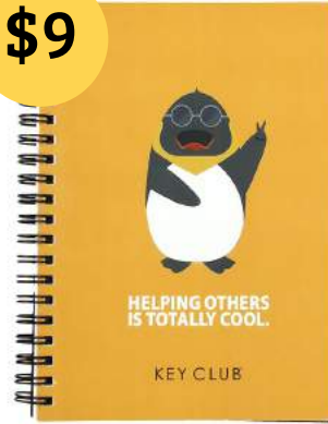
SPIRAL NOTEBOOK (5)