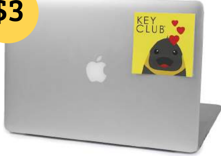
REMOVABLE LAPTOP STICKER (2)